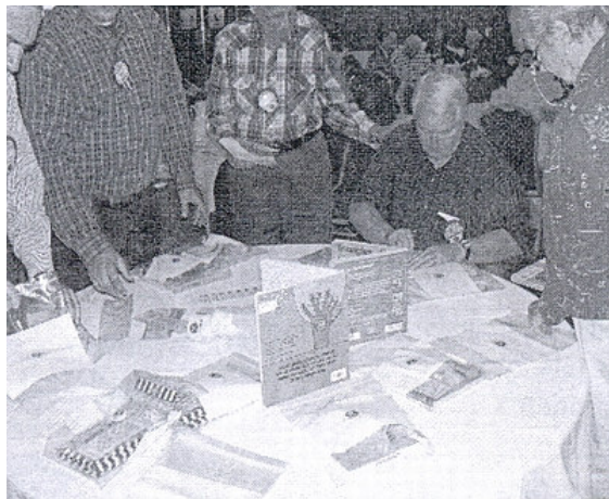
Kiwani members assemble gift bags

Very best wishes to everyone for a happy and blessed holiday!