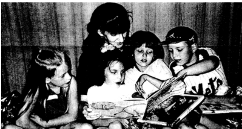
Unidentified kids curl up with a reader and their new books from Books for Kids