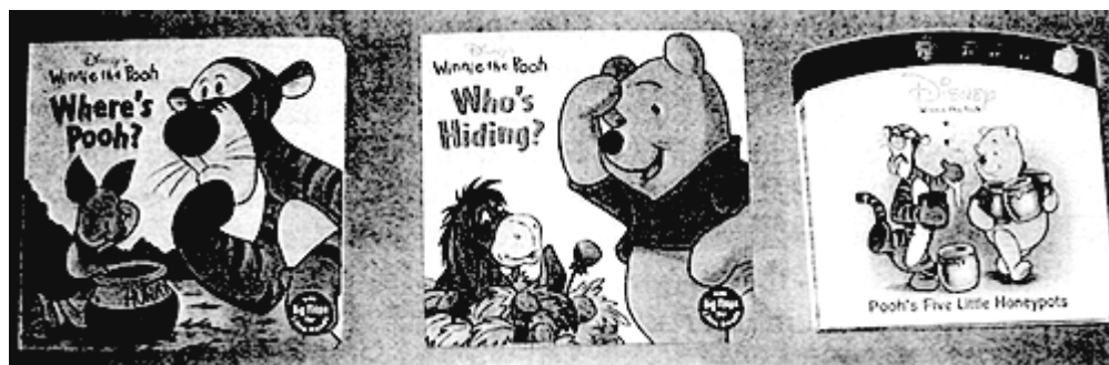
Some of our books currently available for distribution