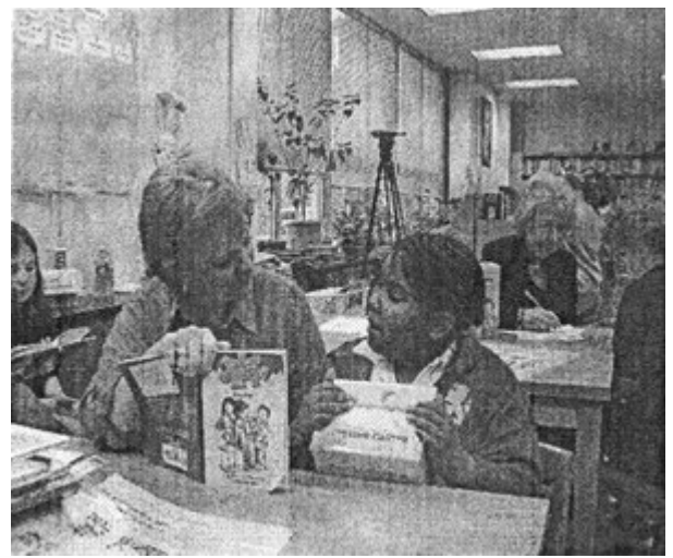
Reading Pals present "Little House" books and read to students at Emerson-Gridley